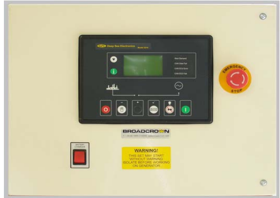
The panel is constructed in 1.5mm steel, powder coated to RAL9001 for a high quality, durable finish.