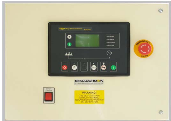
The panel is constructed in 1.5mm steel, powder coated to RAL9001 for a high quality, durable finish.