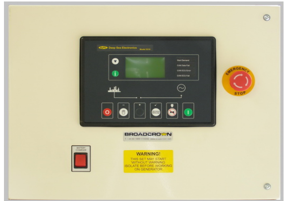
The panel is constructed in 1.5mm steel, powder coated to RAL9001 for a high quality, durable finish.